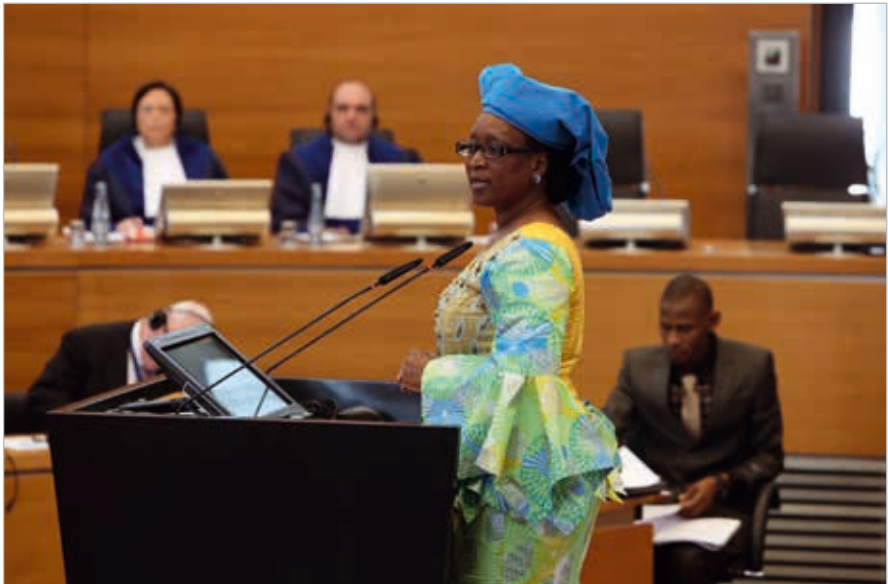
Request for an Advisory Opinion submitted by the Sub-Regional Fisheries Commission (SRFC) (Request for Advisory Opinion submitted to the Tribunal)