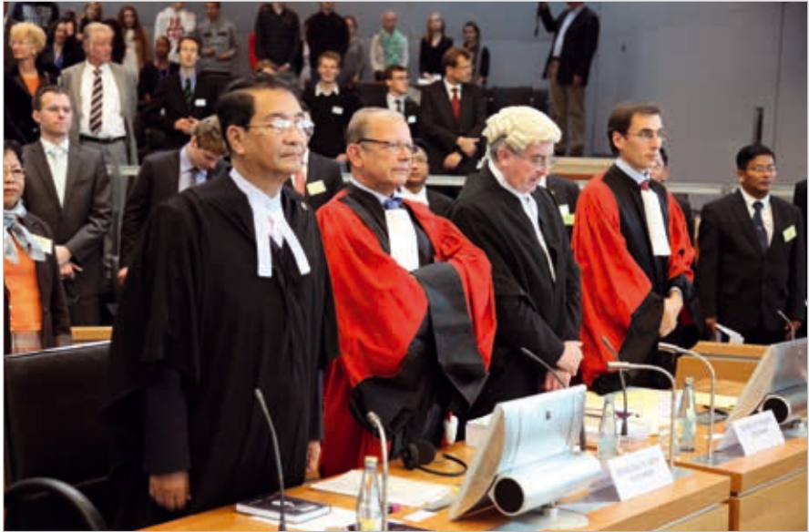
Dispute concerning delimitation of the maritime boundary between Bangladesh and Myanmar in the Bay of Bengal (Bangladesh/Myanmar)