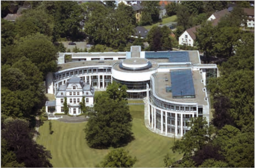
Aerial view of the building