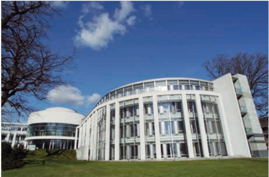
External view of the courtroom and the south wing of the building