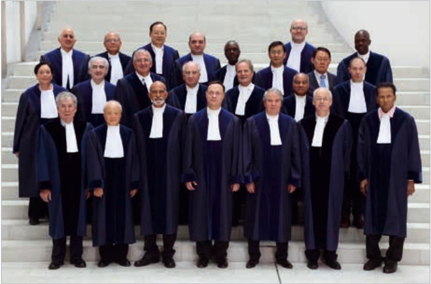
ITLOS Judges (2016)