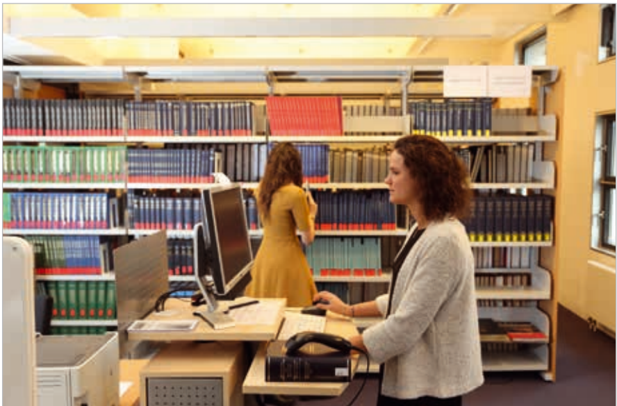
The main library