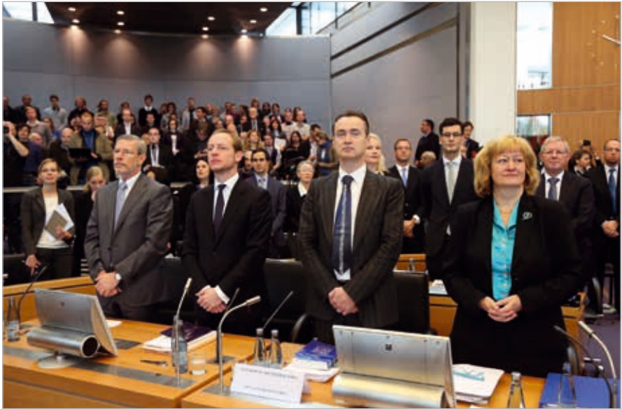
The “Arctic Sunrise” Case (Kingdom of the Netherlands v. Russian Federation), Provisional Measures