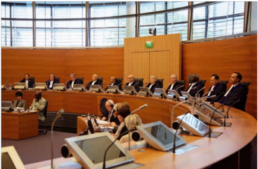
Responsibilities and obligations of States sponsoring persons and entities with respect to activities in the Area (Request for Advisory Opinion submitted to the Seabed Disputes Chamber)