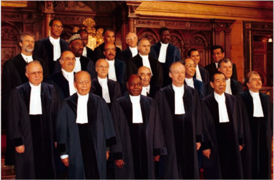
Ceremonial inauguration of the Tribunal, 18 October 1996