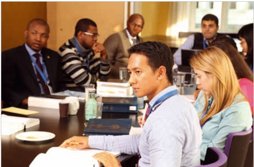
ITLOS/Nippon Capacity-Building and Training Programme lecture