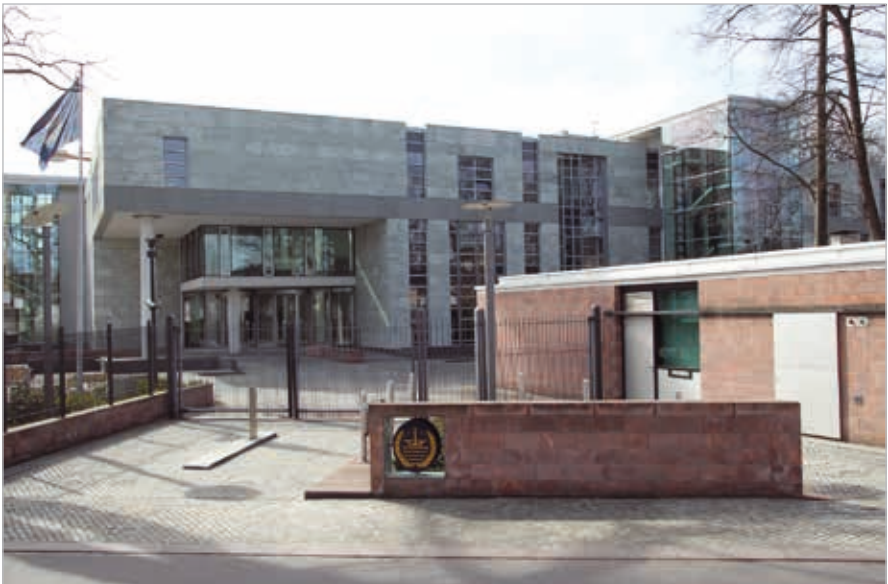
The main entrance