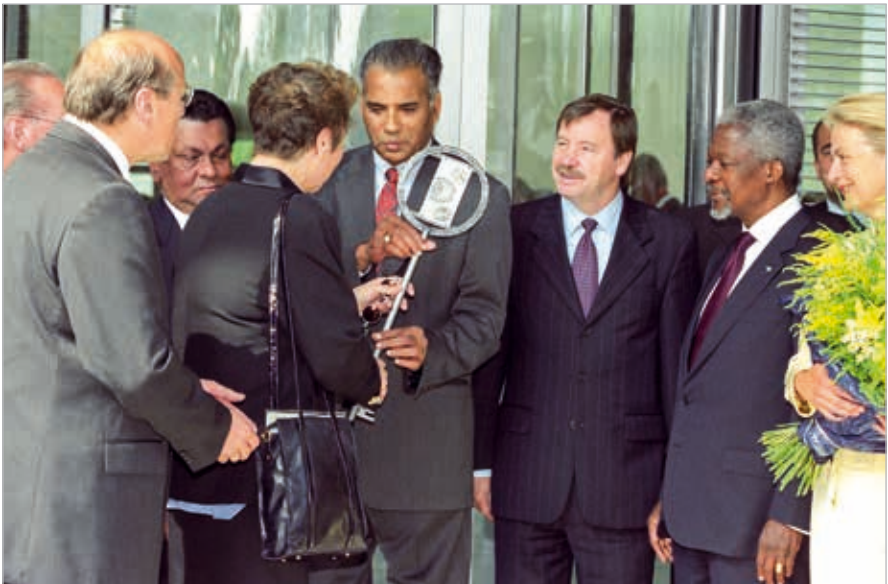
Opening of the Headquarter Building, 3 July 2000