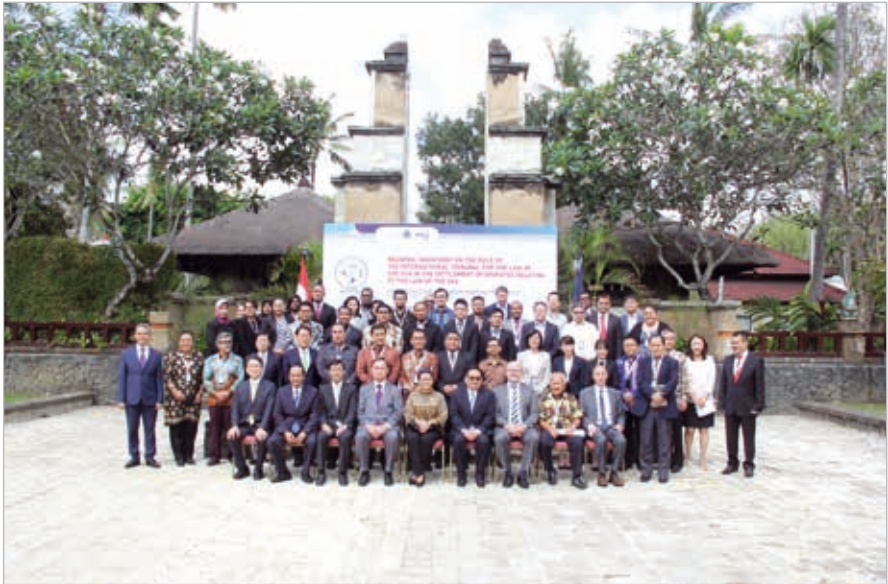
Regional Workshop, Bali